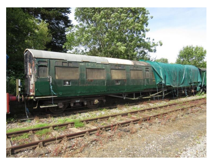
If you fancy something to do on a Sunday, they could do with some help!

There looks like more than a couple of days' work required on this coach!