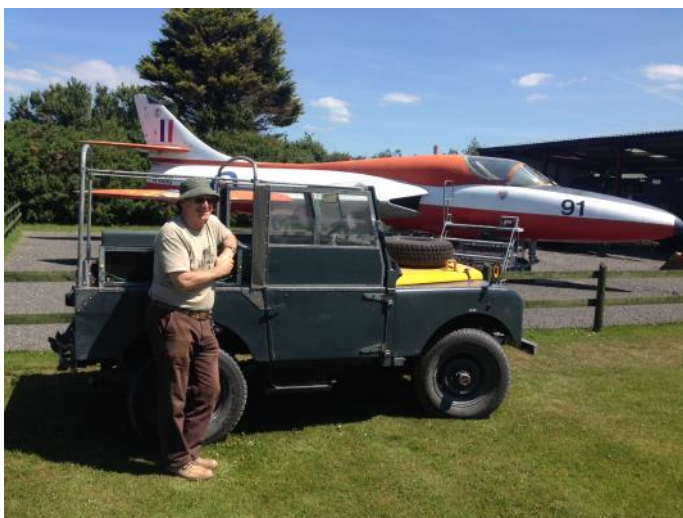
These pictures from Malcolm Munro

With it also being the 100th anniversary of the RAF I've found myself at one or two airshows as well as the usual local rallies with both Purbeck and our own at Harmans Cross.