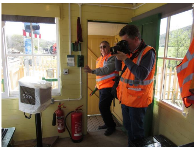
Here he is in Norden Gates crossing keeper's cabin, in the pose in which most people will recognise him – camera glued to eye!