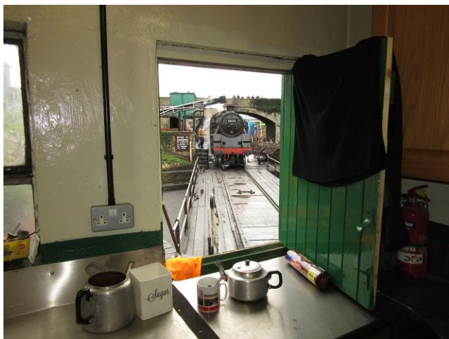
80104 poses on shed, viewed from the kitchen in the drivers cabin.