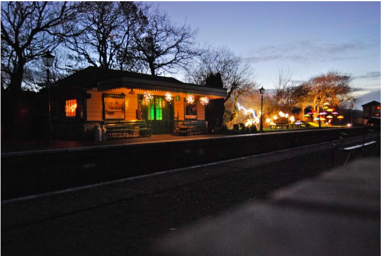
Out at Harmans Cross station there is a display provided as part of Steam and Lights, and decorations provided by the station team.