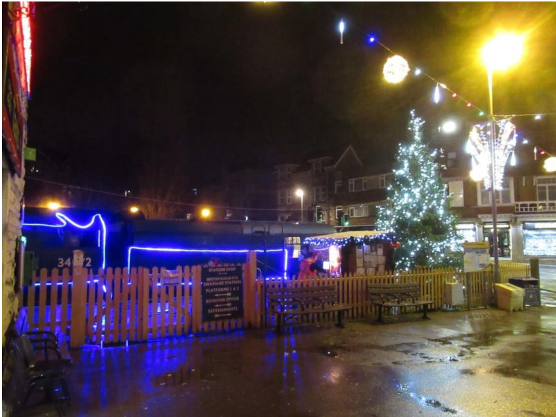
Swanage station on a wet evening ( that's most of them!) with the 19.15 Steam and Lights awaiting departure.

Above, we see 257 Squadron bringing up the rear of the train, and the raffle ticket kiosk sharing the view with Swanage town's Christmas tree.