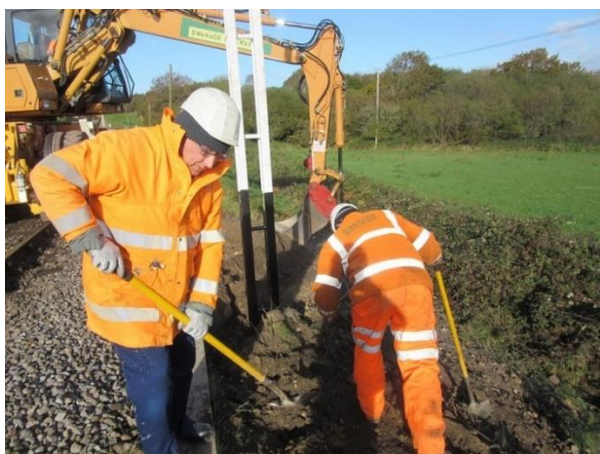
These three photos courtesy of Tony North.

This signal and the Corfe Up Distant are being re-sited to better reflect the stopping distance to the Home signals.